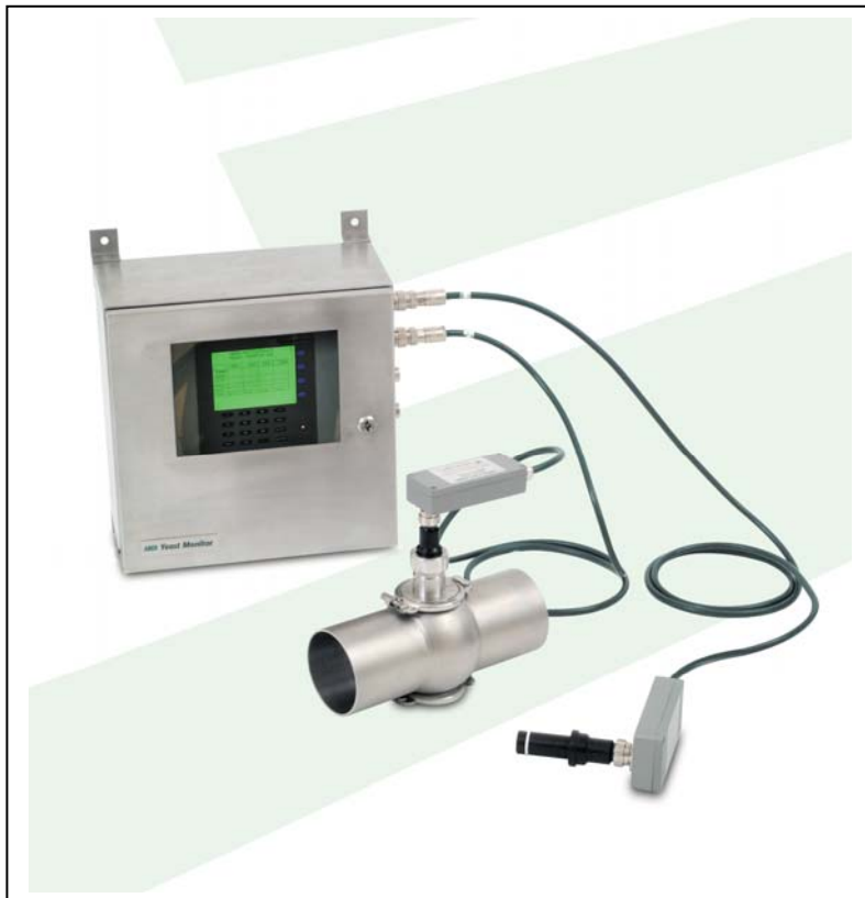
Figure 1 Yeast Monitor Model 720 (Aber Instruments Ltd, UK)

The most recent Yeast Monitor instrument, the Model 720 introduced at the end of 2005 by Aber Instruments Ltd (UK), is shown in Figure 1.